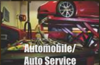
Automobile/ Auto Service